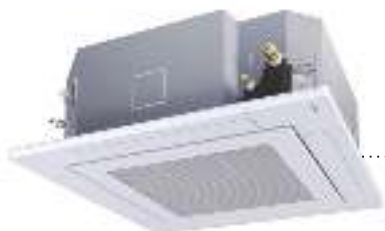
• Cassette Units